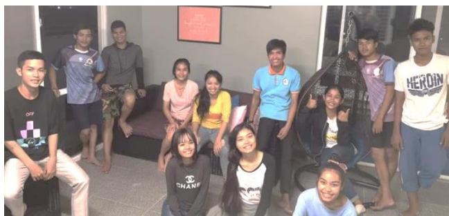
Students at Graduation House enjoying their new social/study area on the top floor of GH.

GH has proved to be an invaluable resource for our students pursuing further studies and a great investment into the ongoing education of the next generation of Cambodia's leaders. Thanks to a generous and timely contribution from The Linden Family Foundation, we created a much-loved and used social/study area on the top floor of GH. We were brimming with pride as Sokhour, one of our