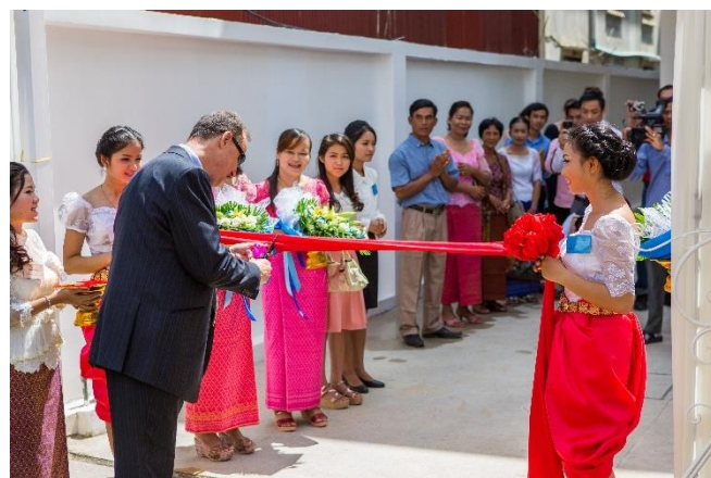
Opening of Graduation House

We beam with pride as our Awareness Cambodia family continues to grow!