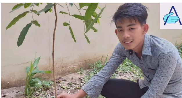
Some of our scholarship students

Awareness Cambodia's Child Development programs are truly a unique model where holistic immersion is a catalyst for transformation – from danger and hopelessness to safety, opportunity and prosperity.