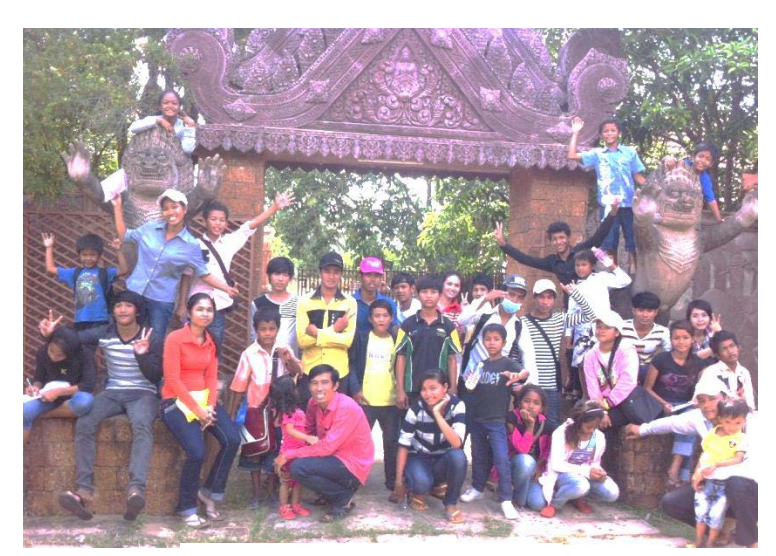
Kompong Speu - museum

The children participated in a feedback session to find areas the program could be improved in for next year.