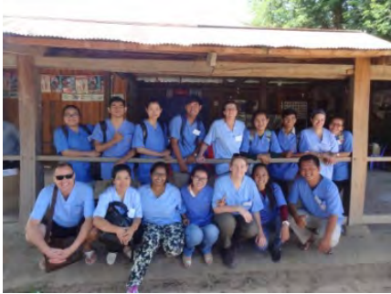
Figure 5: 2016 International Medical Team Volunteers

Operation Nightingale provides 3500 rural Cambodian villagers with primary medical care at seven clinics. It also provides women's health screening services while educating them in the prevention of breast and cervical cancer.