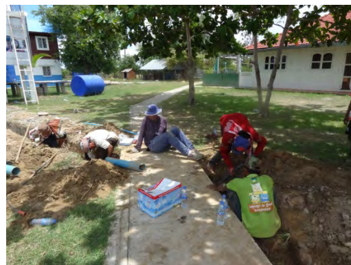
Figure 2: Hundreds of meters of new pipes installed