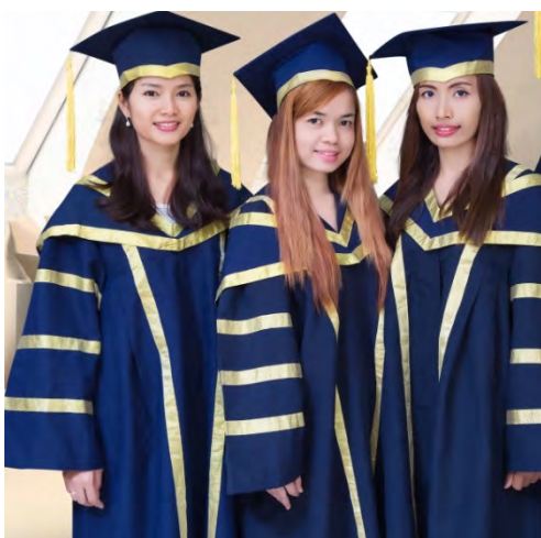
Figure 3: Tourism and hospitality graduates from Western University

We Rescue We Restore We Protect We Empower We Educate