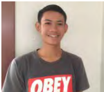
SAEM Thon: Hairdressing Certificate