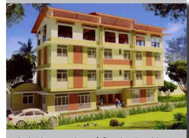
Artist impression of Graduation House