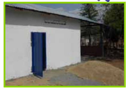
A rice storage unit under construction at Eco Farm.

The project is also beneficial in reducing the cost of pig farming. The project produces a by-product of 'broken rice' – key pig food! We're hoping this will allow for our pig numbers to grow.