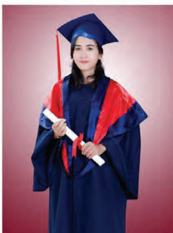
Economics & Science graduate from the Royal University of Law and Economics

A number of House of Progress students have completed their high school studies and are now a part of the Graduation House program. We have two students starting at Norton University – one studying architecture and the other embarking on a civil engineering degree – while a number of our boys are also undertaking vocational training. Our congratulations to them all!