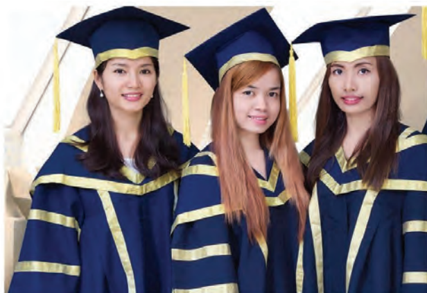
Tourism and hospitality graduates from Western University

House of Progress and Graduation House continue their march forward. In 2016, another four students graduated university: three with well-earned tourism and hospitality degrees and one with an economics degree. All graduates have moved into the community, have taken up employment and are doing well.