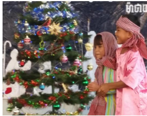
Sunshine House's annual Christmas Party